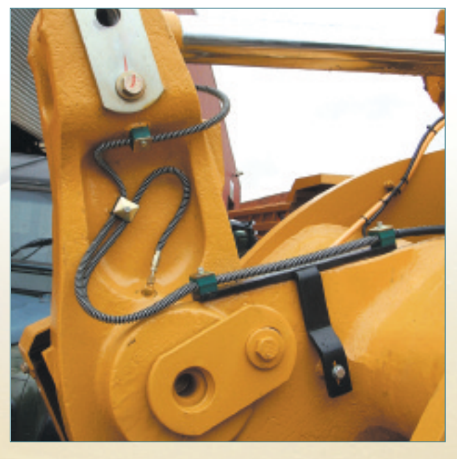
Protected heavy duty flexibles fitted to a CAT loading shovel