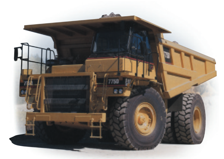
Dump trucks and ADT"s

Mobile plant fitted with the electric keg pump or the heavy duty industrial pump (HDI) will deliver grease to the bearings/pins at pre-determined intervals in calculated amounts through progressive divider valves.